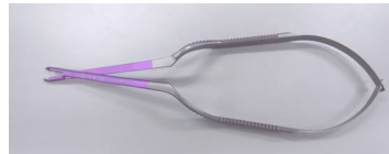
Appliers for Mini type: Pink