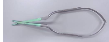
Appliers for Standard type: Green